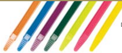
Double Cuff™ Colors